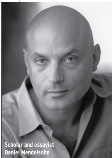
Scholar and essayist Daniel Mendelsohn